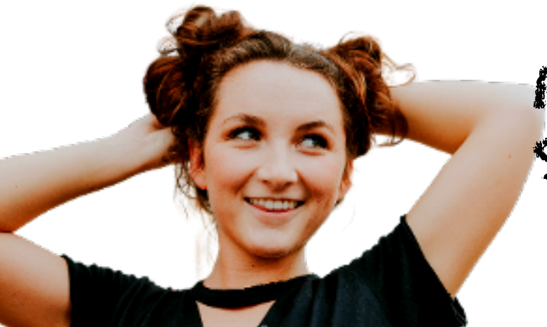
MESSY SPACE BUN