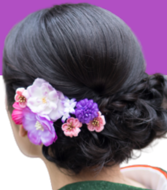
Messy Braid Bun