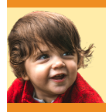
A long tape to measure me,